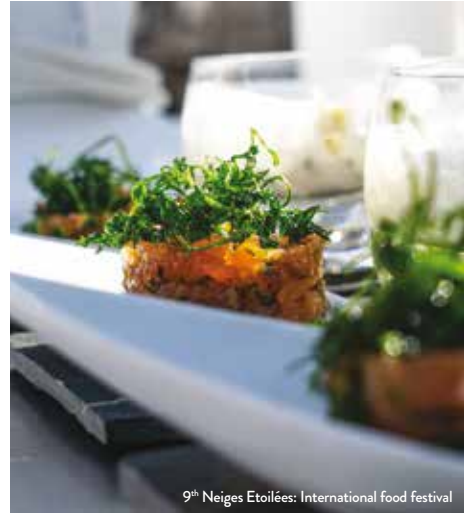
9 th Neiges Etoilées: International food festival