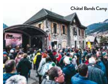
Châtel Bands Camp