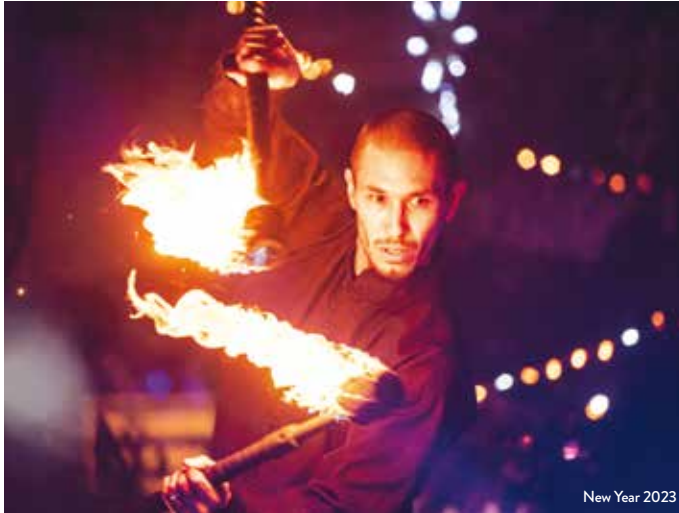
New Year 2023