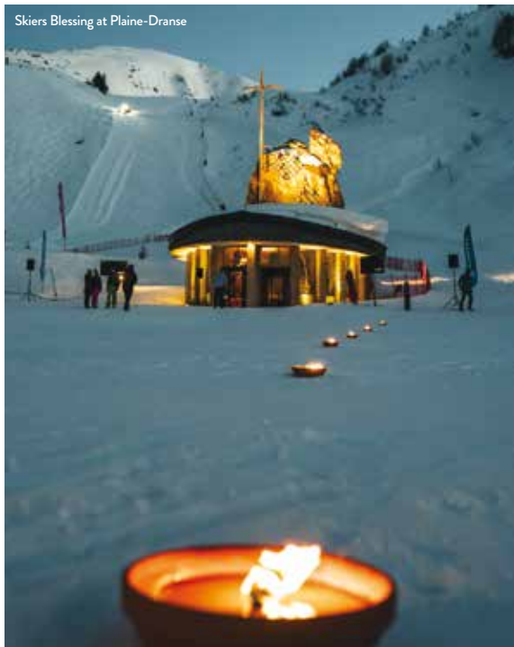
Skiers Blessing at Plaine-Dranse