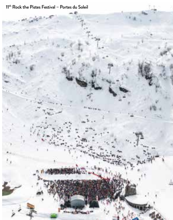
11 th Rock the Pistes Festival – Portes du Soleil