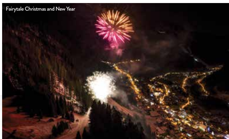
Fairytale Christmas and New Year

As the second edition, the third edition will take place on one day, the 7 th February at Linga, first with the super-G then the dual slalom. Riders must have a licence issued by a National Federation affiliated to the UCI (Union Cycliste International).