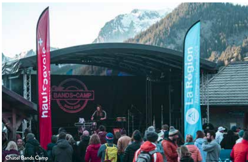
Châtel Bands Camp

The music continues for après ski in the resort with concerts in the village performed by new and upcoming artists, and... of course, any musical members of the public wishing to join are very welcome on stage. A great atmosphere guaranteed!