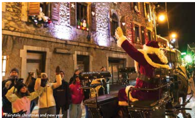
Fairytale christmas and new year

Enjoy a festive Christmas in the mountains: Father Christmas arrives to share sweets with the children, torchlight descents light up the slopes for everyone to enjoy, and New Year's Eve is celebrated outdoors with music and fireworks, - the perfect way to welcome the year ahead.