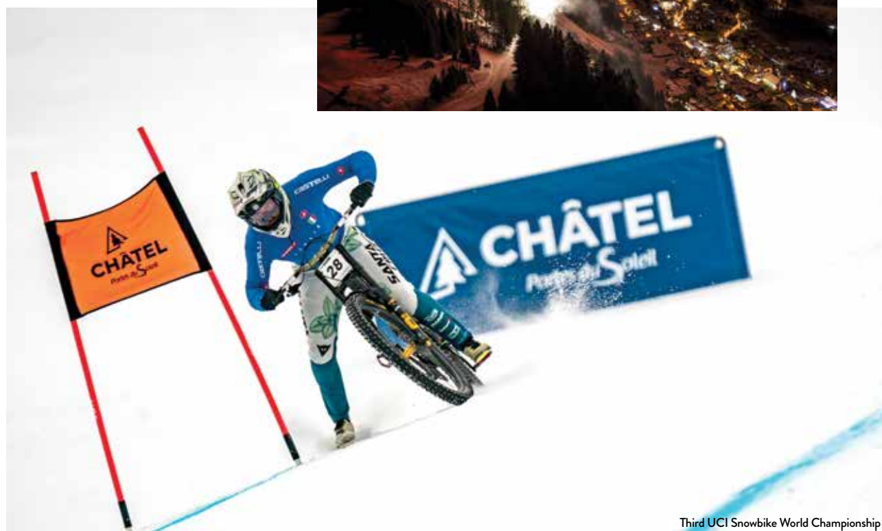
Third UCI Snowbike World Championship