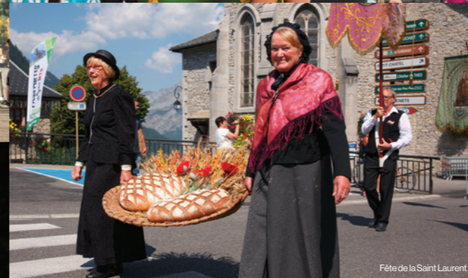
Fête de la Saint Laurent