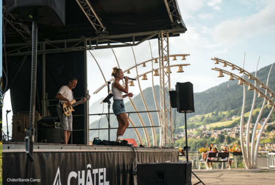
Châtel Bands Camp