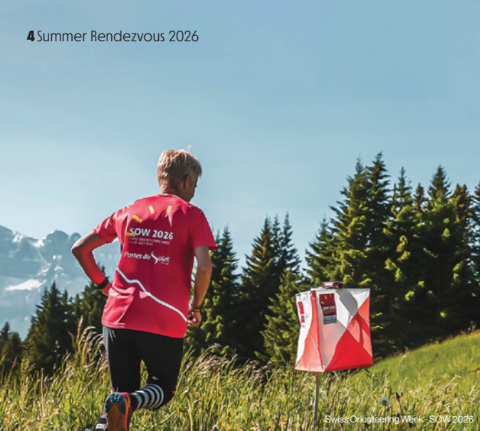
Swiss Orienteering Week - SOW 2026