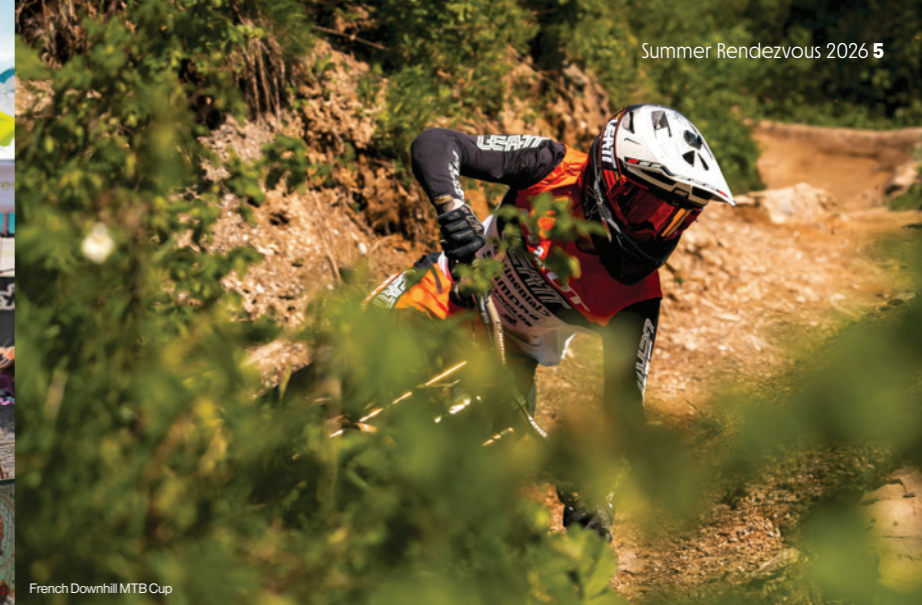
French Downhill MTB Cup