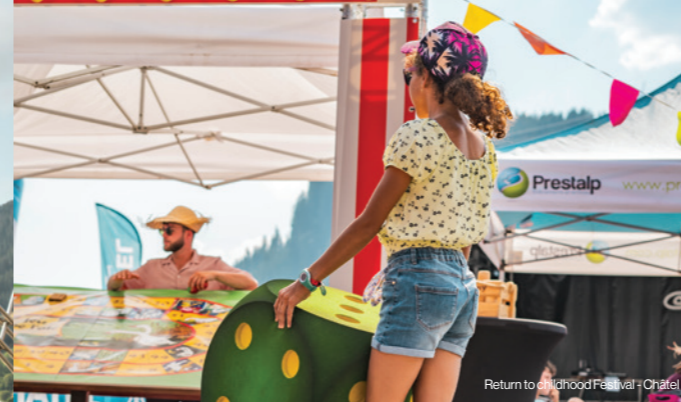
Return to childhood Festival - Châtel