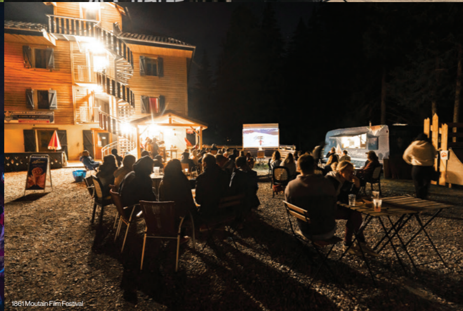
1861 Mountain Film Festival