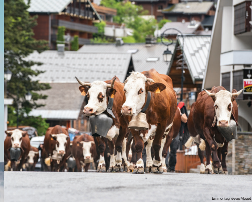
Emmottagnée au Mouët