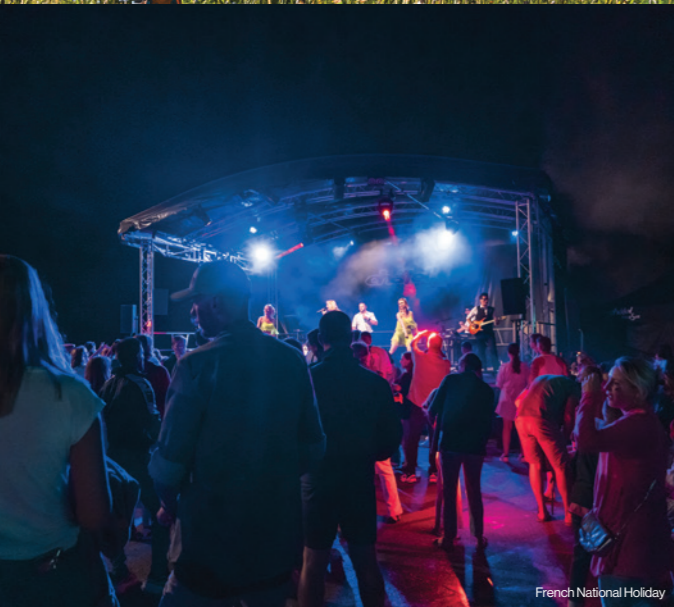
French National Holiday