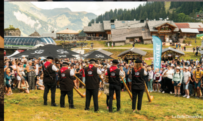
La Belle Dimanche