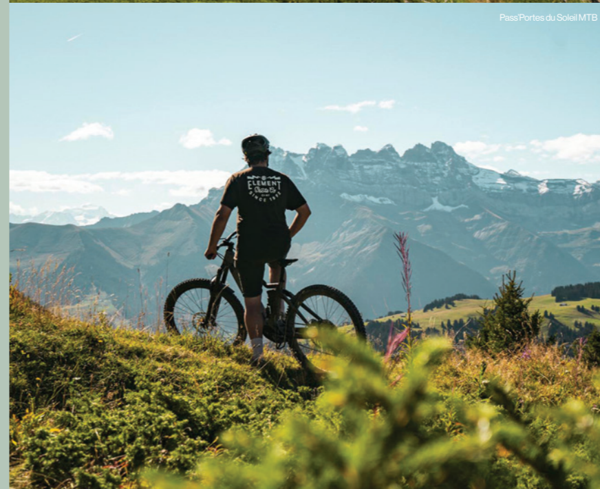
Pass'Portes du Soleil MTB